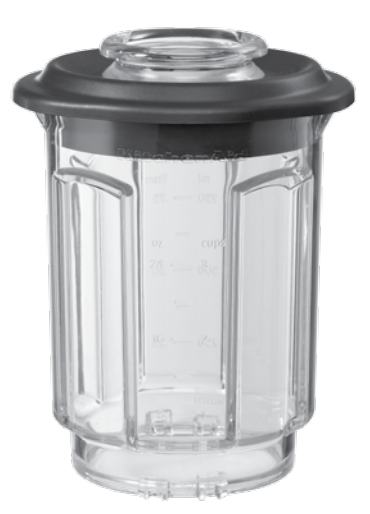
Model 5KSBCJ 0,75 L Culinary Blender Jar

RECIPIENT PENTRU BLENDER CULINAR INSTRUCTIONI